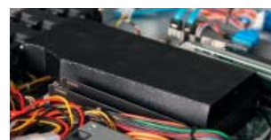
Wind tunnel for optimised airflow